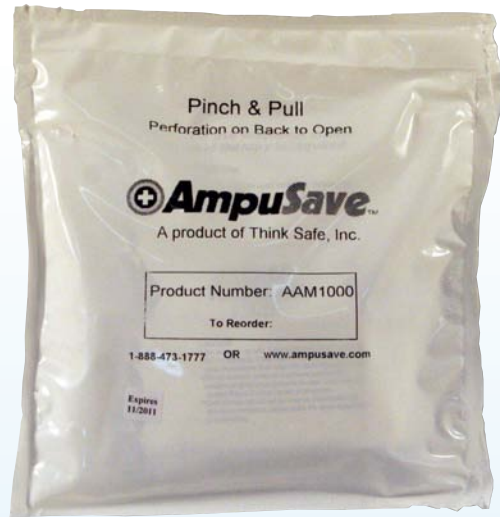
8.5" x 7.5" x 1" bag at 11 ounces

AmpuSave is a medical transport device that allows for proper storage and transport of severed digits and avulsions. AmpuSave consists of a storage compartment for a cold compress (which is included and sealed) and another storage compartment for gauze, saline solution, and an instruction card for proper preparation, as well as the necessary storage of the amputated digit or avulsion for transport. The included instruction card allows for recording the time of the injury and the injured party's name for accurate reporting of the incident.