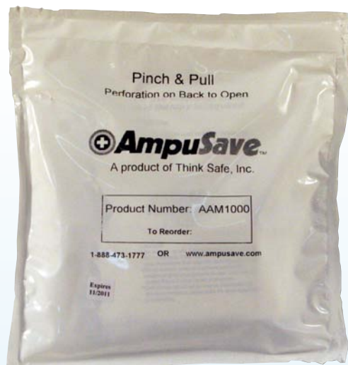
8.5" x 7.5" x 1" bag at 11 ounces

AmpuSave is a medical transport device that allows for proper storage and transport of severed digits and avulsions. AmpuSave consists of a storage compartment for a cold compress (which is included and sealed) and another storage compartment for gauze, saline solution, and an instruction card for proper preparation, as well as the necessary storage of the amputated digit or avulsion for transport. The included instruction card allows for recording the time of the injury and the injured party's name for accurate reporting of the incident.