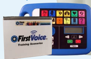
31" x 18" x 6" light-weight carrying case

Comes in a soft-sided, light-weight carrying case!